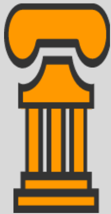
Sharing best practices